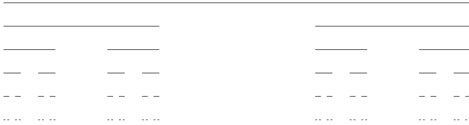
Figure 1: steps in the construction of a Cantor set.